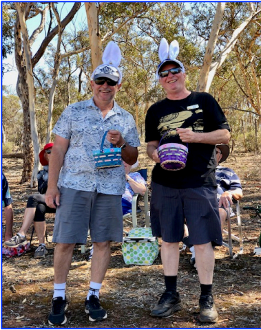
Easter bunnies bearing eggs.