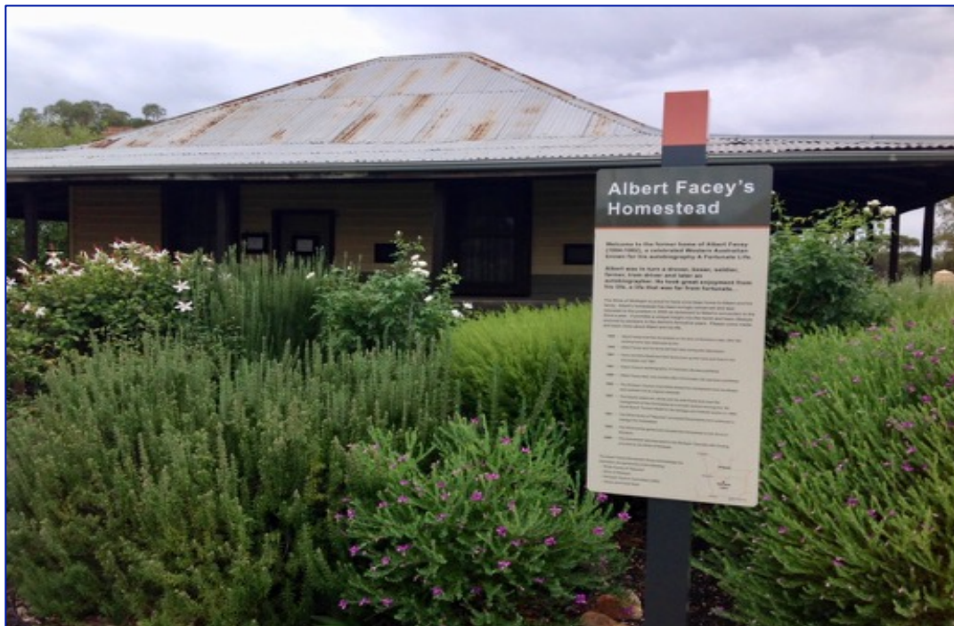
Sandgroper's enjoyed a tour of Albert Facey's historic homestead at Wickepin.