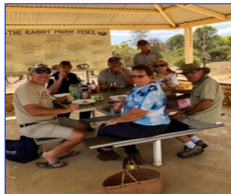
Enjoying a picnic near Toolibin.