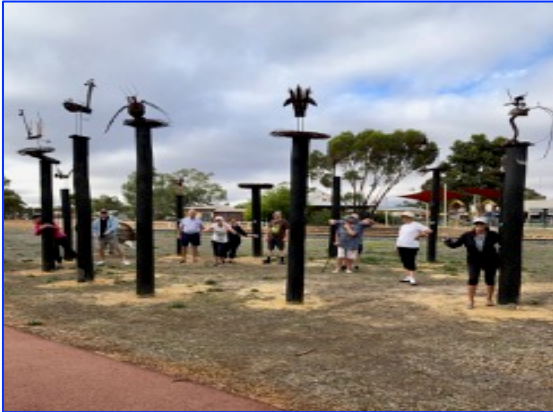
Walkers trapped in the local artworks.